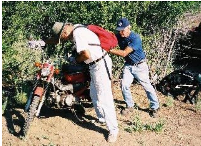
Different Strokes for Different Folks